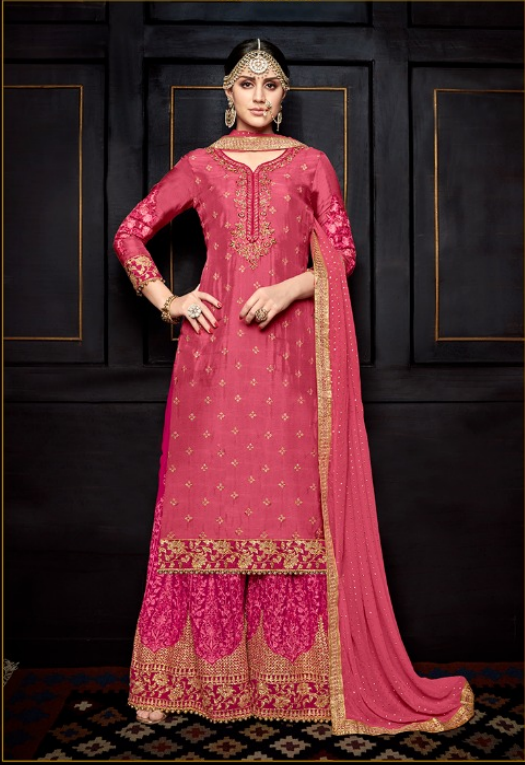
The grace and dignity which only a dress can impart. The piece of artistry of this dress tell altogether a different story.