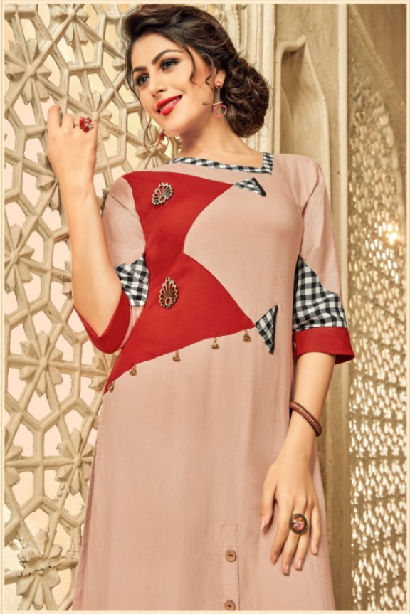
V.E. - 3006