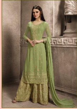
❖ 3001 ❖