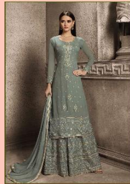
❖ 3005 ❖