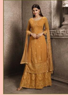
❖ 3004 ❖