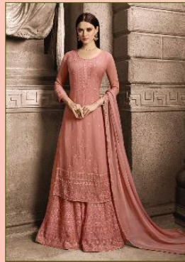
❖ 3003 ❖