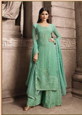
❖ 3002 ❖