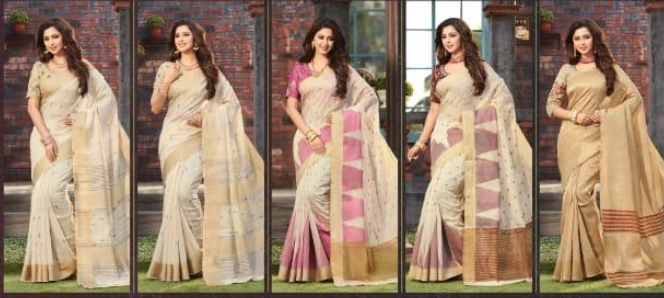
FS - 5501 / A