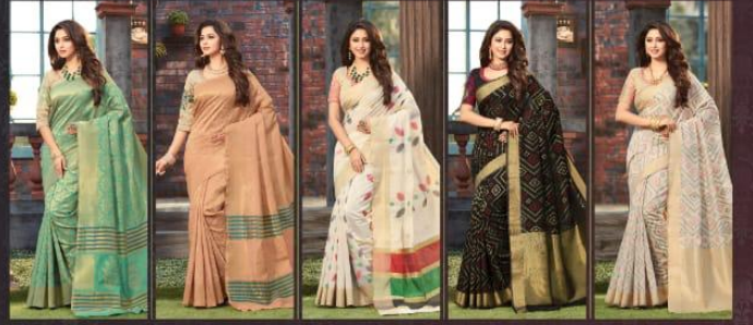
FS - 5503 / B