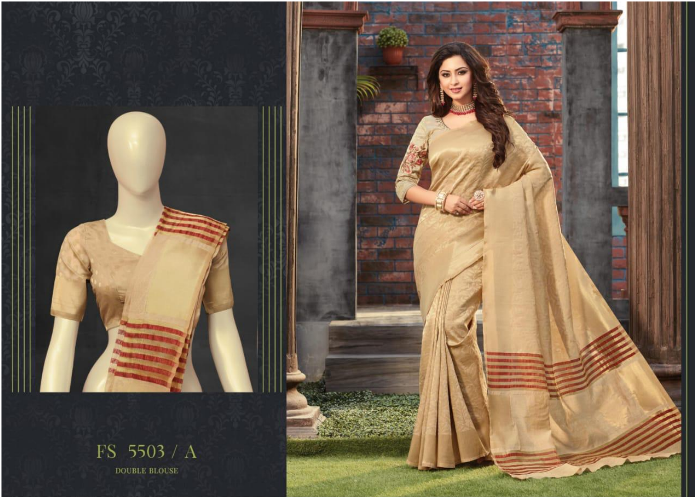
FS 5503 / A DOUBLE BLOUSE