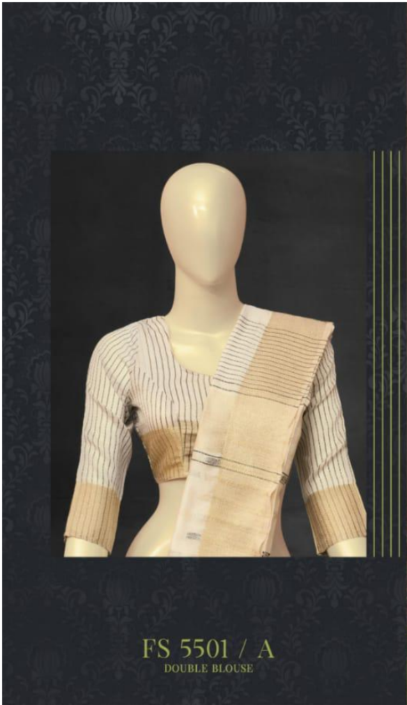
FS 5501 / A DOUBLE BLOUSE