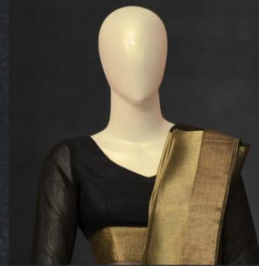
FS 5505 / A DOUBLE BLOUSE