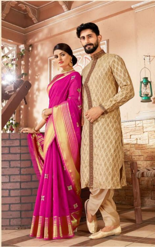
Bright red with blue combination a very better design including different shades, contemporary style design with check border to edge a perfect design for any occasion any time