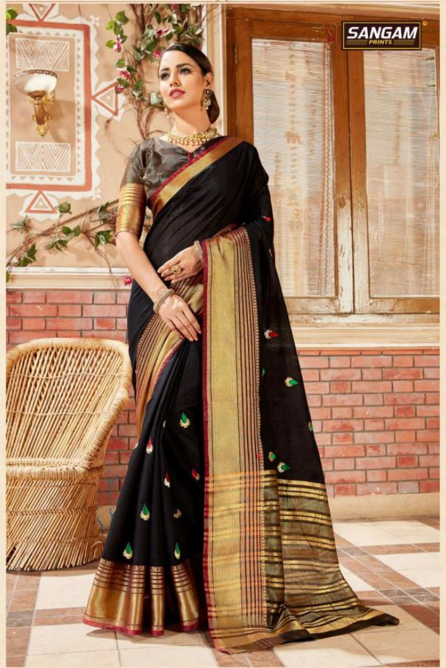
What is the common factor between 'strong' and 'brand'? It's a 'Sangam' connection. Both are essential to give your business the look of 'Sangam'.