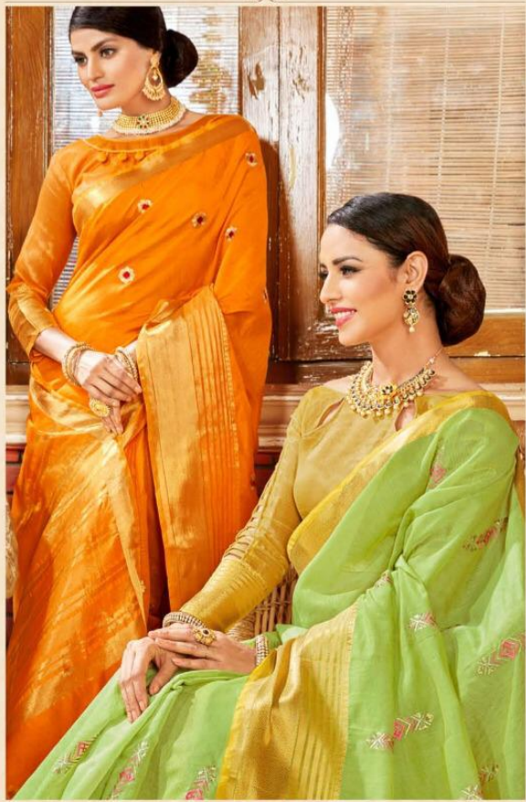
The classic south Indian saris are given a magic touch with a dash of contemporariness. Wear it on an evening affair with slim belted your fingertips.