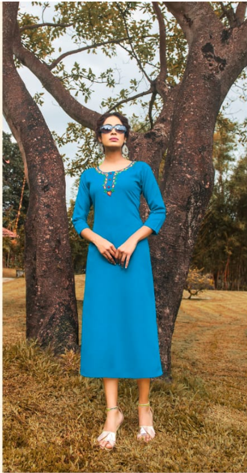
India, there are a couple of hundred Indian fashion designers producing designs and wears. Some are well known and are expanding slowly but surely into the international market. D.no - 1006