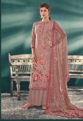
D NO 340