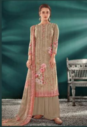
D NO 342