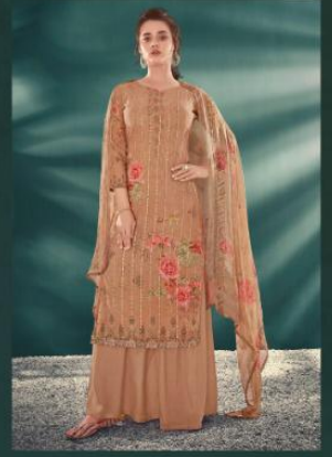
D NO 345