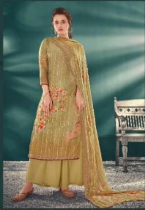
D NO 343