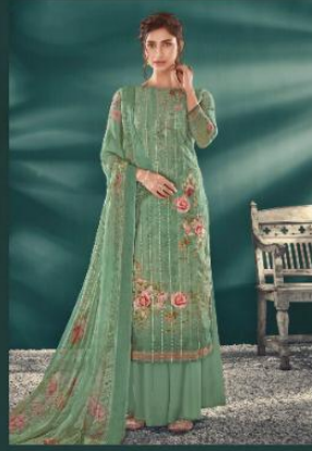
D NO 344