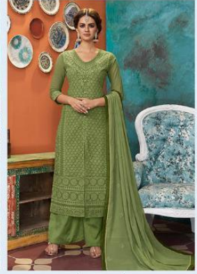
| 2001 |