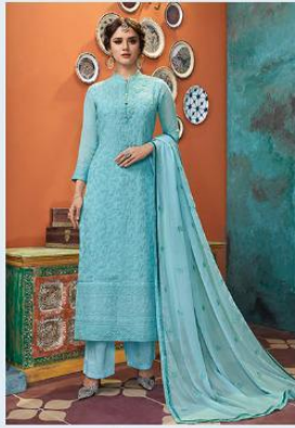
| 2001 |