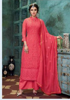
| 2001 |