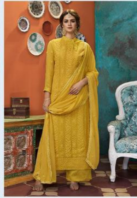
| 2001 |