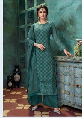
| 2001 |