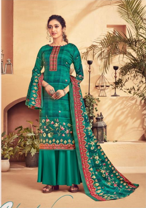
Cyano diva Brilliant hues & lustrous textures give you a new makeover this season. D.No:87007