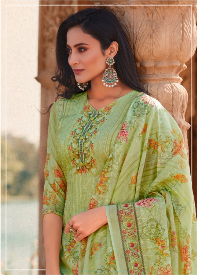
CLASSIC STYLE WITH LUXURIOUS SOFT FABRICS ARE HIGHLIGHTED BY REFINED AND FEMINE DETAILS.