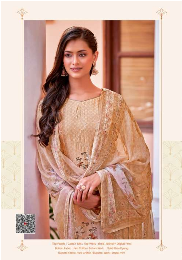
Top Fabric : Cotton Silk / Top Work : Emb. Allover* Digital Print Bottom Fabric : Jam Cotton / Bottom Work : Solid Plain Dyeing Dupatta Fabric: Pure Chiffon / Dupatta Work : Digital Print