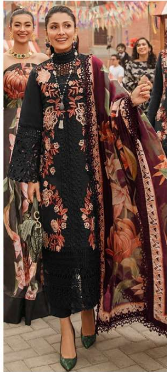
DN-GZ 4141 A

TOP - PURE COTTON WITH EMBROIDERY BOTTOM - COTTON SOLID DUPATTA - COTTON MAL-MAL DIGITAL PRINT