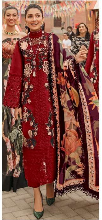
DN-GZ 4141 C