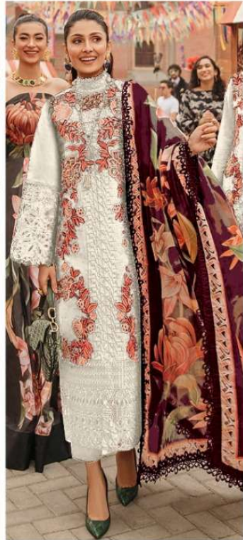
DN-GZ 4141 B