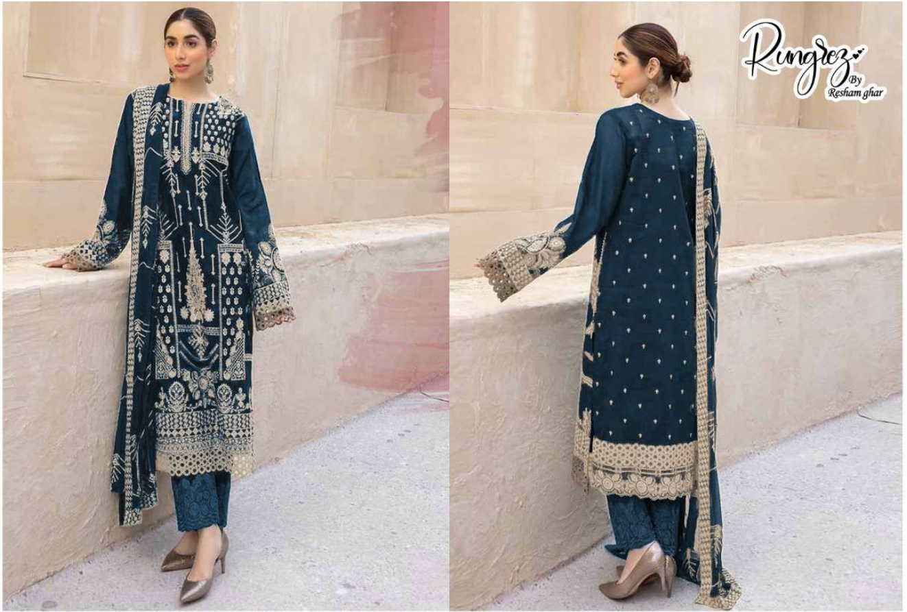
TOP : HEAVY EMBROIDERY WITH STONE WORK BOTTOM : SANTOON WITH EMBROIDERY PATCH DUPATTA : HEAVY EMBROIDERY WORK WITH LACE WORK