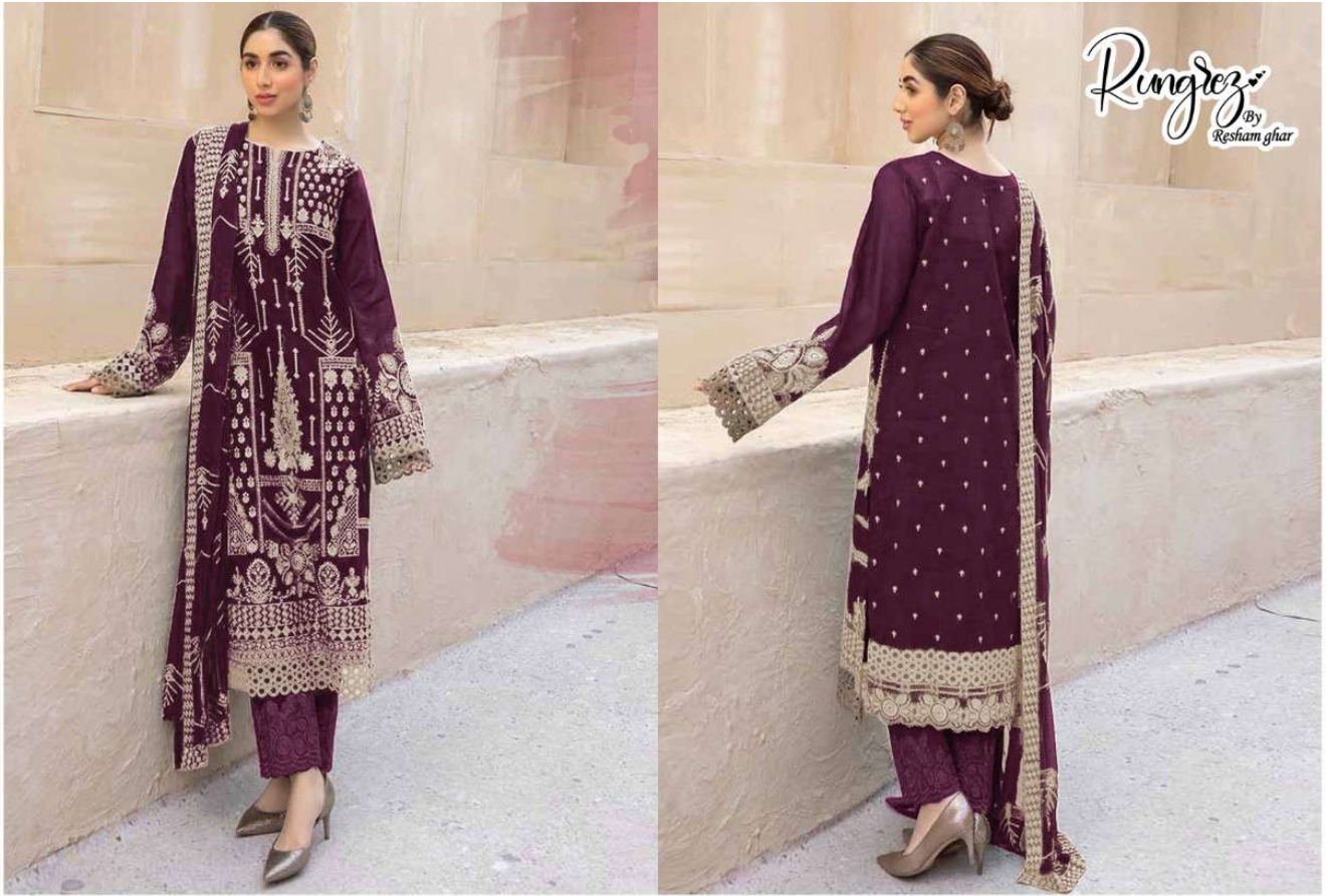
TOP : HEAVY EMBROIDERY WITH STONE WORK BOTTOM : SANTOON WITH EMBROIDERY PATCH DUPATTA : HEAVY EMBROIDERY WORK WITH LACE WORK