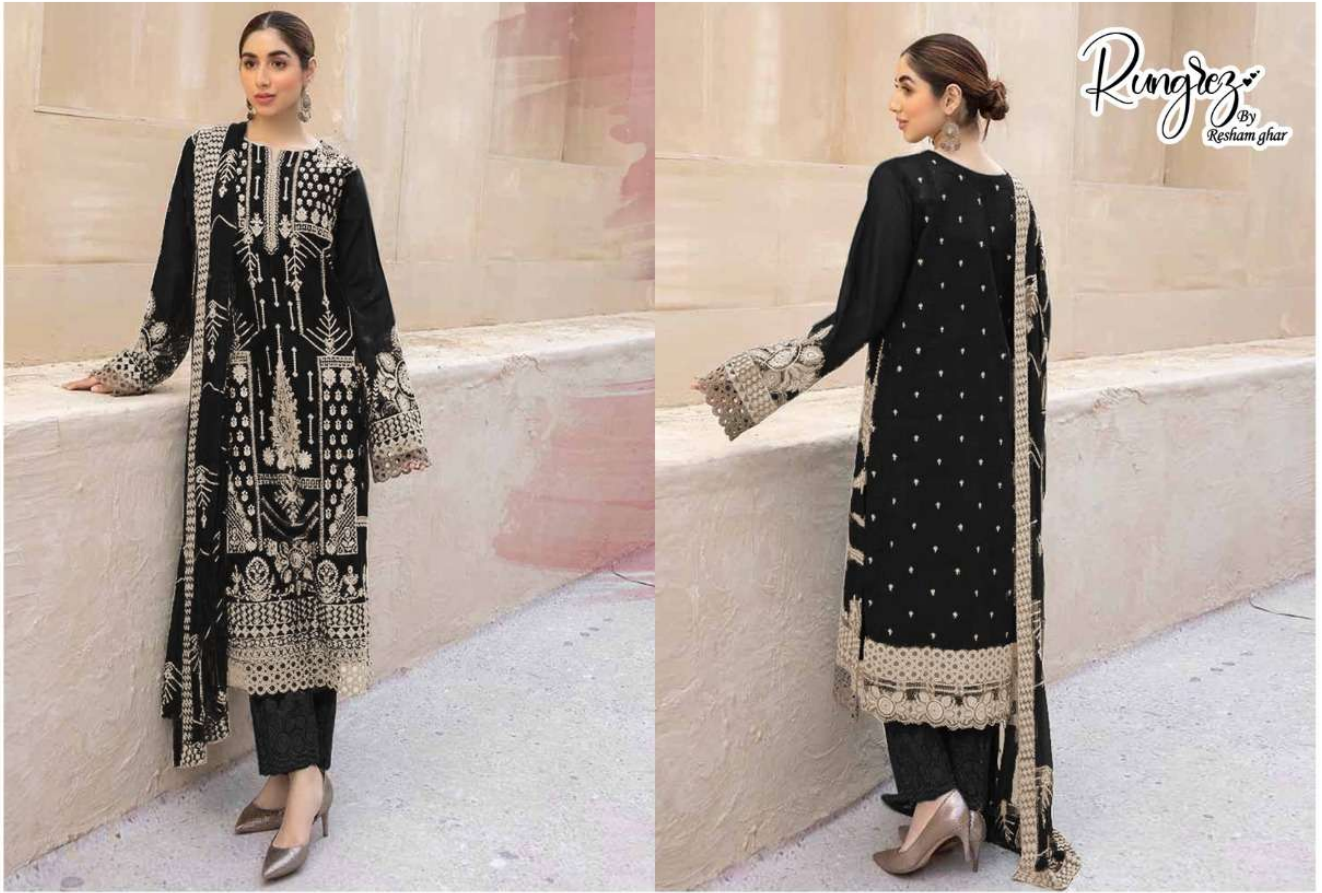
TOP : HEAVY EMBROIDERY WITH STONE WORK BOTTOM : SANTOON WITH EMBROIDERY PATCH DUPATTA : HEAVY EMBROIDERY WORK WITH LACE WORK