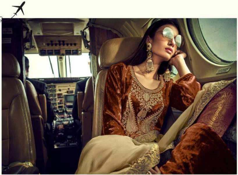
An exclusive designer series to take away all the situations, the colors used in the garment to also majestic.