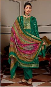
MANDAKINI | 7002