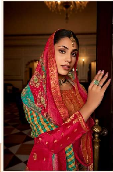
MANDAKINI | 7003