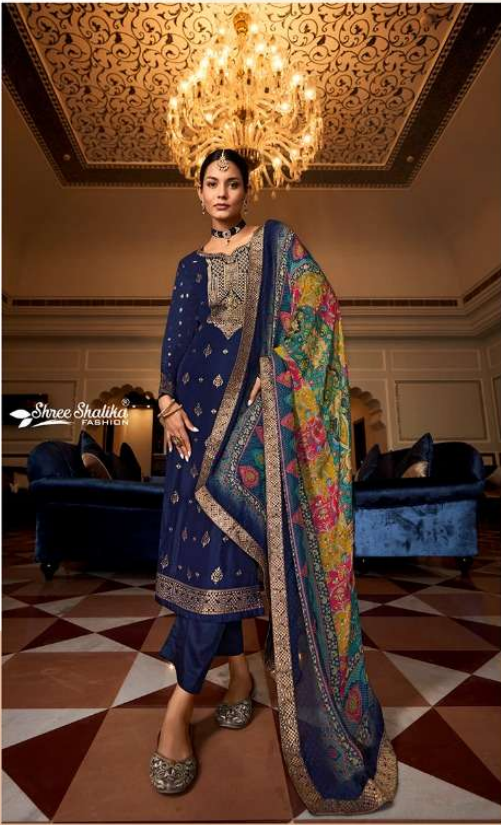
MANDAKINI | 7006