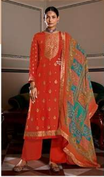
MANDAKINI | 7001