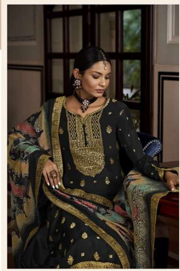
MANDAKINI | 7008