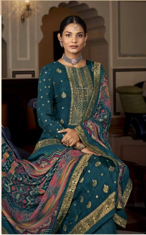
MANDAKINI | 7004