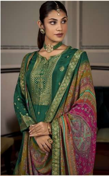
MANDAKINI | 7002