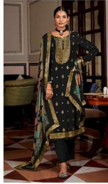
MANDAKINI | 7008