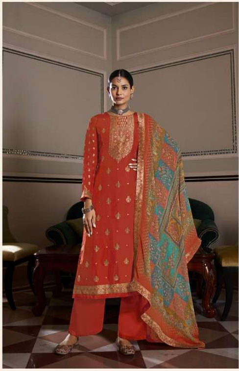
MANDAKINI | 7001