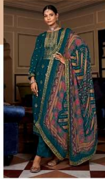
MANDAKINI | 7004