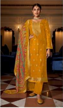
MANDAKINI | 7007