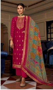
MANDAKINI | 7005