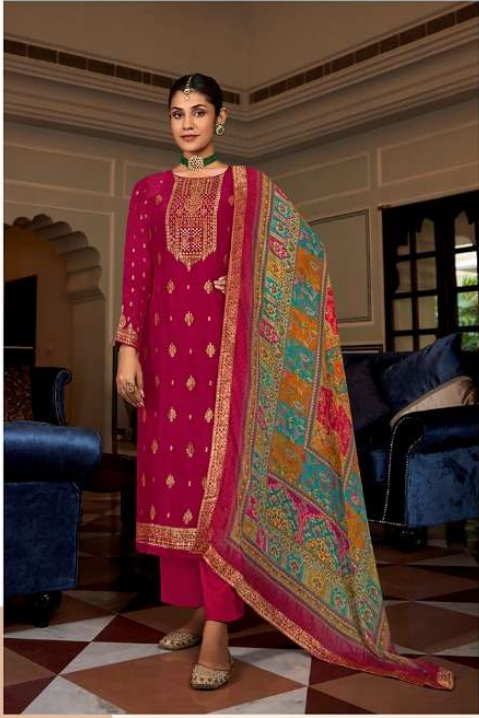
MANDAKINI | 7005