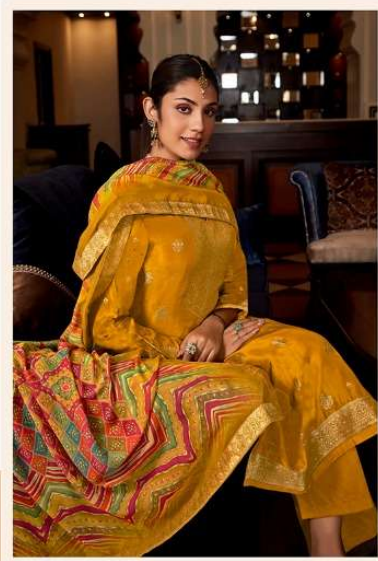
MANDAKINI | 7007