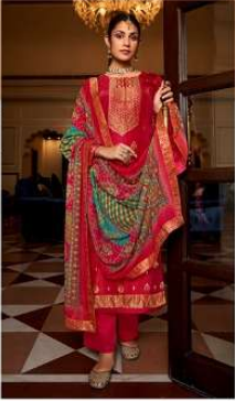
MANDAKINI | 7003