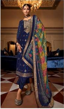
MANDAKINI | 7006