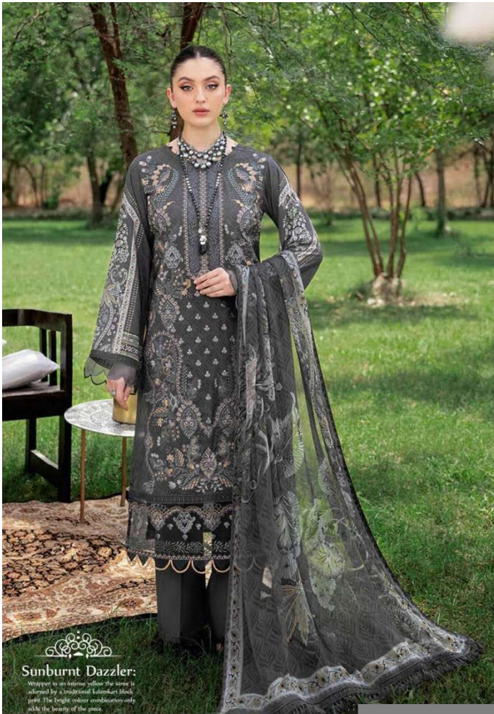
Sunburnt Dazzler: Wrapped in an intense yellow the horse is adorned by a traditional Lakshmi black gold. The bright color combination only adds the beauty of the piece.