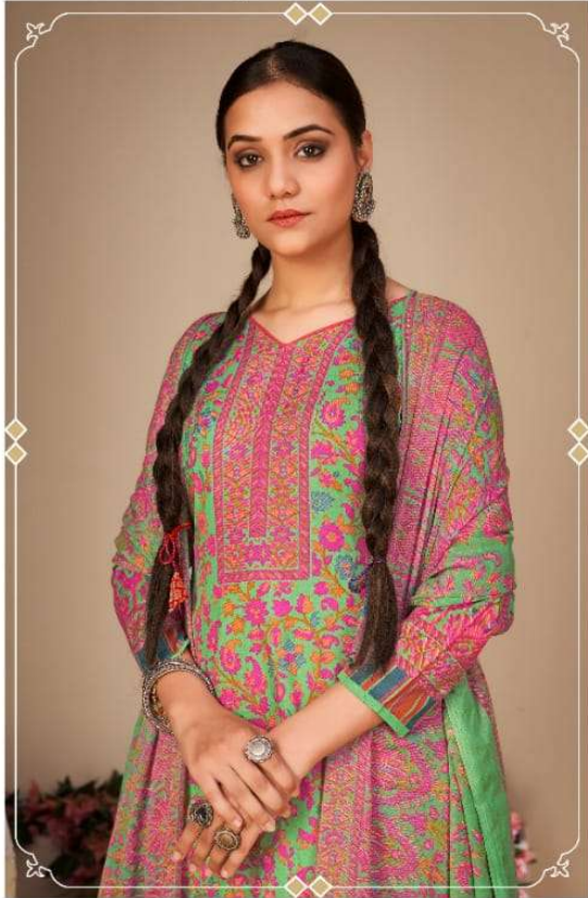
8113 Fashion is not necessary about labels its not about brands Its about something else that comes from within.