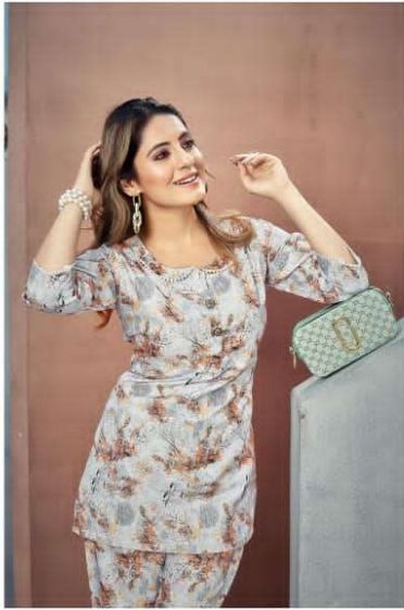
Brings out the brand's classics and reinvents them into