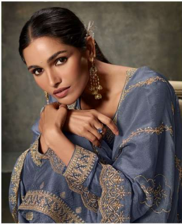
Brighten up your festive mood D.NO.14873