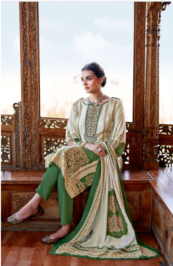
Nourishing unbelievable Crafts with freshness in styling for Perfect charming appearance of you. This splendid piece of fusion, perfectly immaculate your personality.