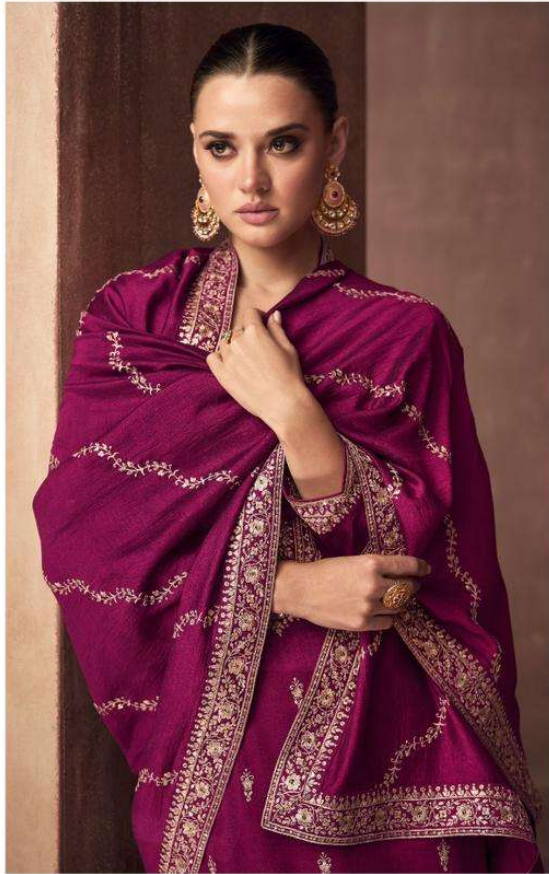
A - 9582