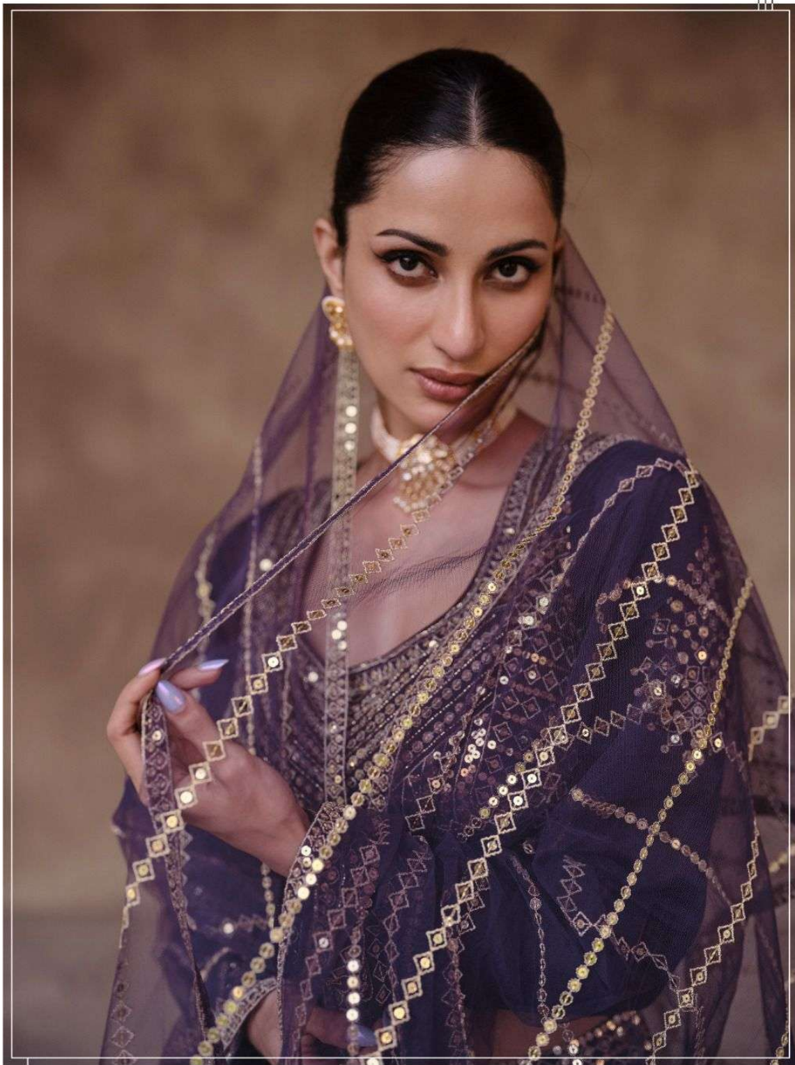
A breath taking array of fine detailing & intricate design inspired by Indian culture ..... CODE - 5394