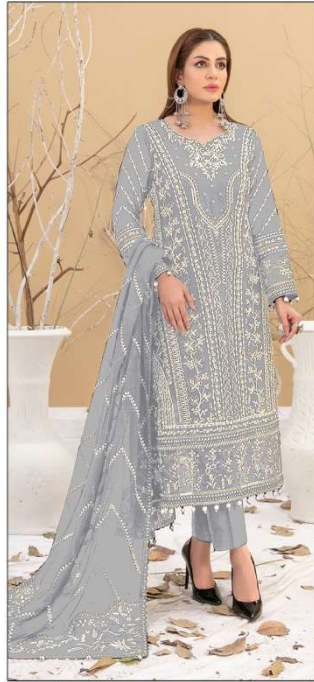
S - 271 B