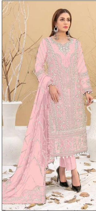
S - 271 C