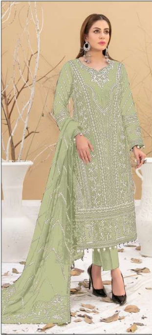
S - 271 A