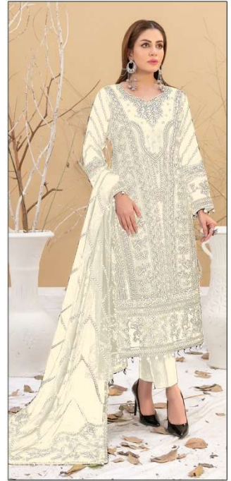
S - 271 D