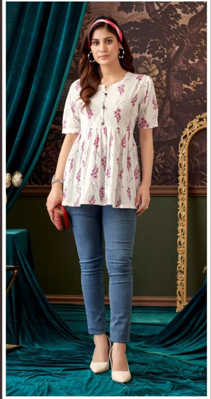
D No. 1003