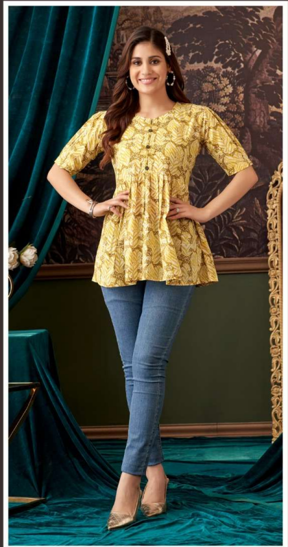
D No. 1005