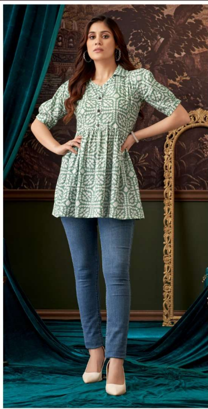
D No. 1004