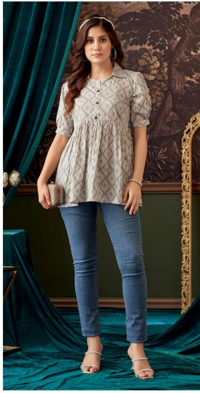
D No. 1002