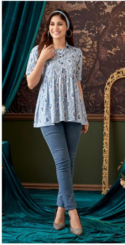
D No. 1001