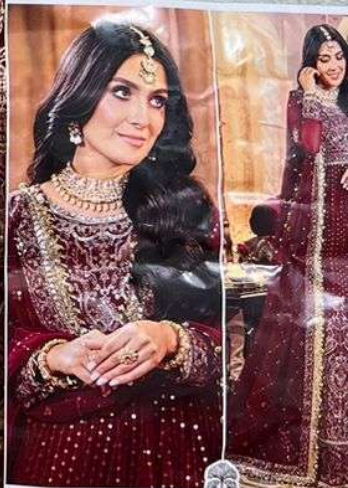
CHANTELLE ZAHA D.NC Vol-10 TOP Butterfly net with Embroidery BOTTOM INNER Dull Satton DUPATTA Butterfly net with Embroidery