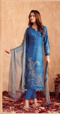
NIRAN | 1006