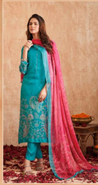
NIRAN | 1003