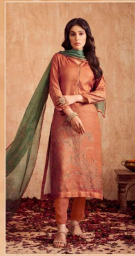
NIRAN | 1007