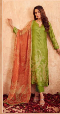
NIRAN | 1004