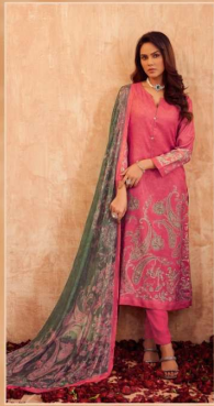
NIRAN | 1005