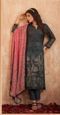
NIRAN | 1002