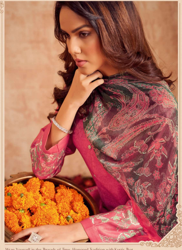
Wrap Yourself in the Threads of Time-Honored Tradition with Kurtis that Reflect the Grace of Our Ancestry, Beautifully Tailored for the Woman's Wardrobe. NIRAN|1005