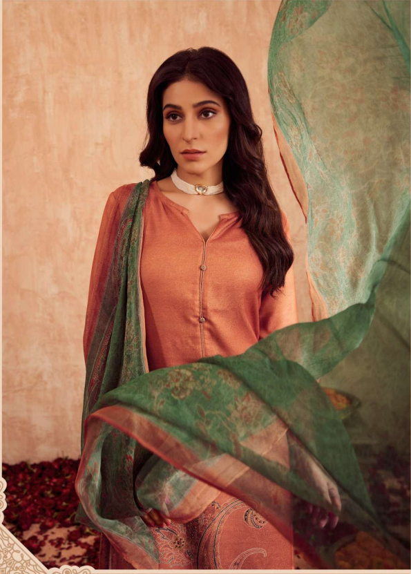
NIRAN | 1007

Experience the Legacy of Our Ancestors Through Kurtis That Weave Tradition into Every Fiber, Creating a Seamless Blend of Cultural Richness and Modern Sophistication