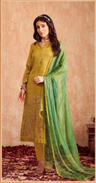
NIRAN | 1001