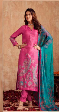
NIRAN | 1008

Let the rich hue of elevate your style & make you stand out!