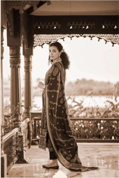
Fashion dress styles blend modern elements with traditional aesthetics adapting to changing fashion trends.