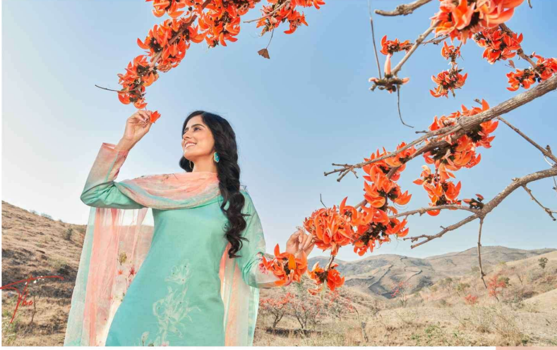
A round up of the hottest trends this festive seasons you the chicest ways to wear pastels prints.