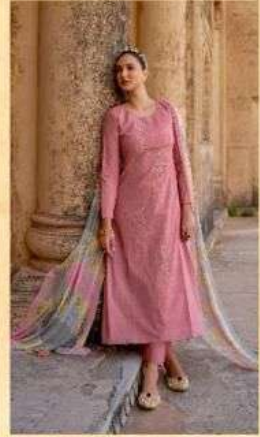
D. No. 346