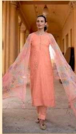
D. No. 347