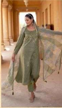
D. No. 342