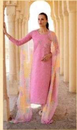
D. No. 348