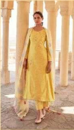
D. No. 343