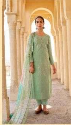
D. No. 345