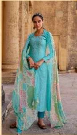
D. No. 344