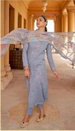
D. No. 341